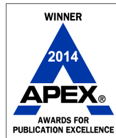
Rebranding won Multiples of America an APEX Publication Award