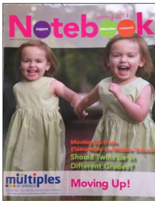
New look for Notebook, the quarterly magazine

We did it! The rebranding may have been challenging, but the experience has been positive for Multiples of America as a whole. We are excited about the opportunities ahead, and look forward to watching our organization continue to grow and flourish as our rebranded name brings us new opportunities and members.