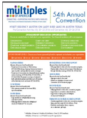
Letterhead, brochures, and forms are part of the total rebranding