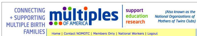
A new Masthead was created for the current website